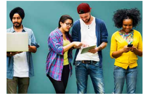
Choosing subjects and courses at 18