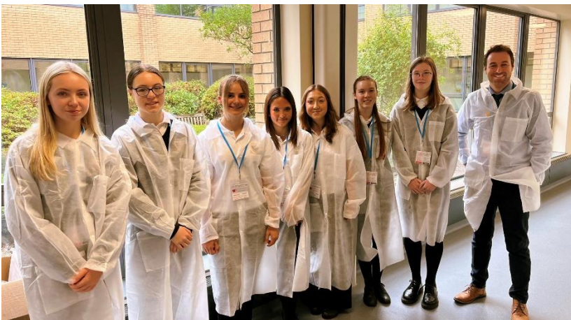
Year 9 students visit Welsh Blood Service HQ on an experience day