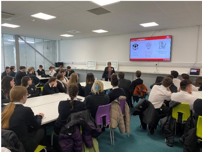
Welsh Blood Service deliver an assembly to Year 12

Bryntirion has formed an excellent link with the Welsh Blood Service. For several years the blood donation truck has visited our school site with Sixth Form students and staff donating. This year we look forward to the truck coming back to Bryntirion again. We have strengthened our link further through the Victory for Velindre Challenge, with our winning Dragons' Den team visiting the organisation's headquarters on an experience day to witness at first hand the running of the service.