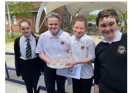
Victory for Velindre Enterprise & Employability Challenge Dragons Den School Heats and Final July 2023 (Bryntirion Year 9 Pupils with Velindre Patron Sam Warburton)