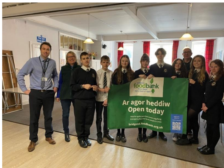
Year 9 pupils taking part in the First Give Step Up Programme with Bridgend Food Bank spring term 2023