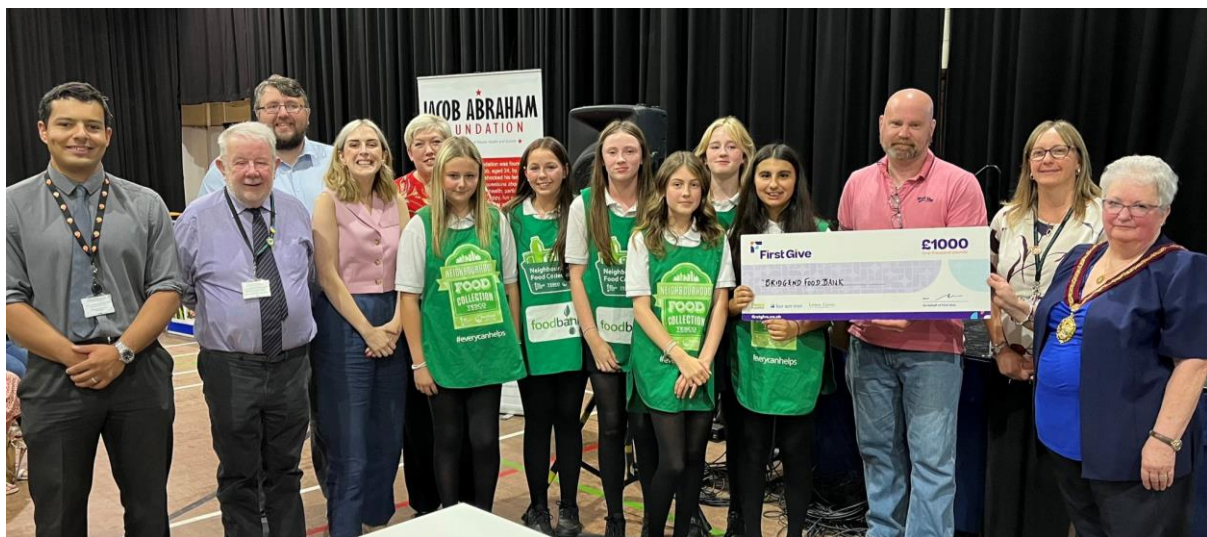
Bryntirion Year 8 pupils present a £1,000 cheque to Bridgend Food Bank at our First Give School Final July 2023