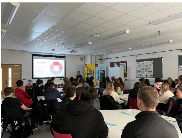
Year 12 students attend a lecture at University of South Wales October 2023

Our Year 12 students took part in our Future Destinations Week, exploring a wide range of options for progression into higher education, apprenticeship programmes and employment. Students attended a series of workshops, mock interviews and talks provided by external speakers and members of Bryntirion Alumni. Our Careers Wales Business Engagement Advisor provided a large number of employers who supported the activities. All our Year 12 students visited the University of South Wales Treforest Campus, taking part in a series of lectures linking to the Advanced Skills Baccalaureate Wales Global Community Project.