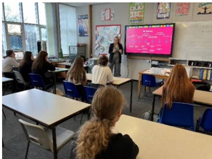
Bryntirion Alumni members meet with Year 12 students during their Future Destinations week summer term 2023

Bryntirion Comprehensive School is developing an Alumni Community to help us reconnect with our former students and keep in touch with leavers from the day they leave.