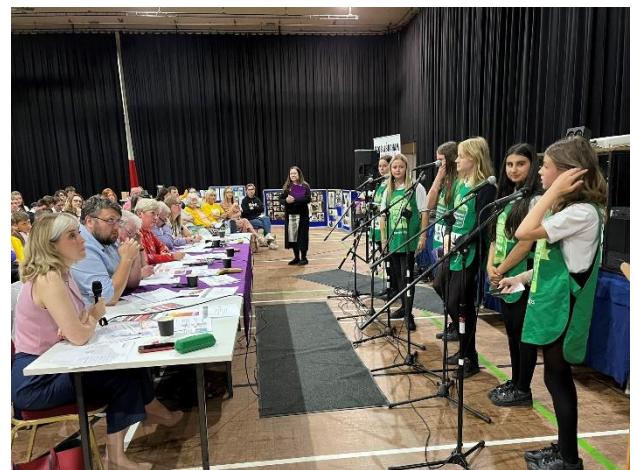
Judging panel consisting of the Senedd Member for Bridgend and Porthcawl and the Mayor of Bridgend County July 2023

First Give has been introduced in Year 8 during form time. The First Give programme inspires and empowers young people to take action to make a positive change in society. The main purpose of the Programme is to support our learners with the development of skills integral to the four purposes in Curriculum for Wales. Each form class selects a social issue and then works alongside a locally based charity to plan and organise social action. The programme culminates in each form class presenting to a judging panel at the First Give School Final, which takes place in the summer term. At the school final, the winning form class is presented with a £1,000 grant for their class charity, this year this was Bridgend Food Bank.