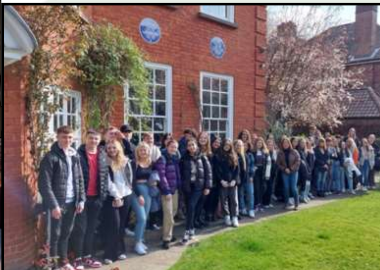
EDUCATIONAL VISIT TO FREUD MUSEUM, LONDON