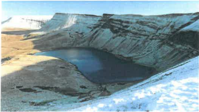
Legend has it Llyn y Fan Fach in Carmarthenshire was one of the gateways to Annwn - the Celtic otherworld.

The spooky traditions of Halloween are often associated with North America, but could the roots of those traditions lie closer to home than we think?