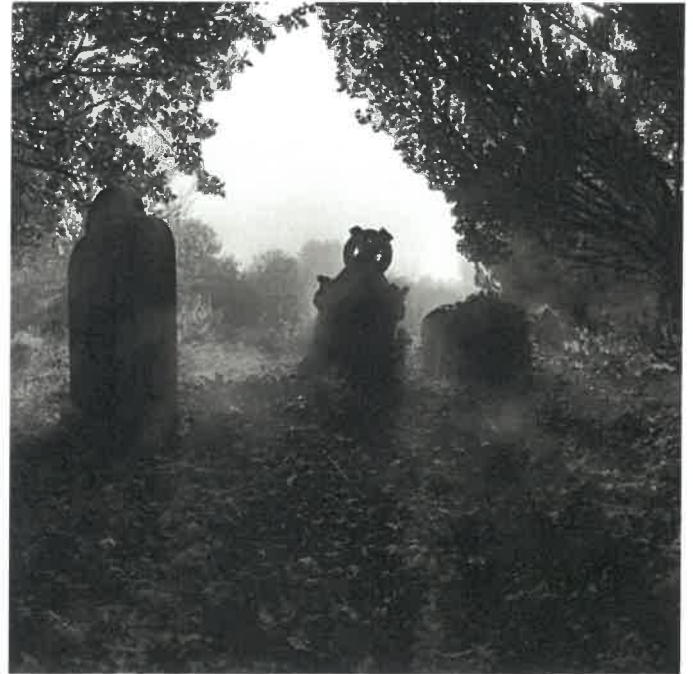
During Noson Galan Gaeaf people were afraid of going to graveyards and crossroads, as they believed spirits would gather in these places.