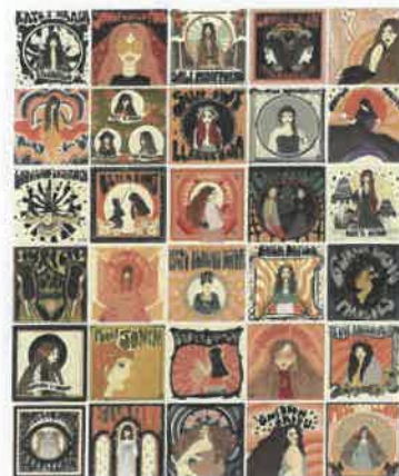
GWYBODAETHYD WELSH WITCHES

https://shop.library.wales/products/welsh-witches