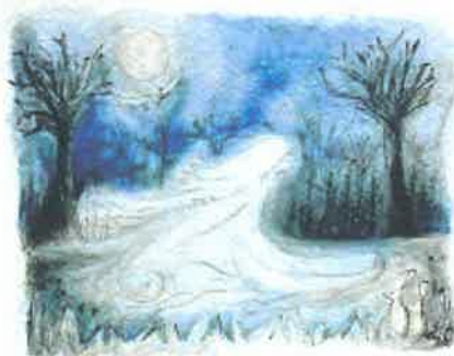
Y Ladi Wen

Scared locals would stay away from graveyards, crossroads and stiles, believing spirits would gather there.